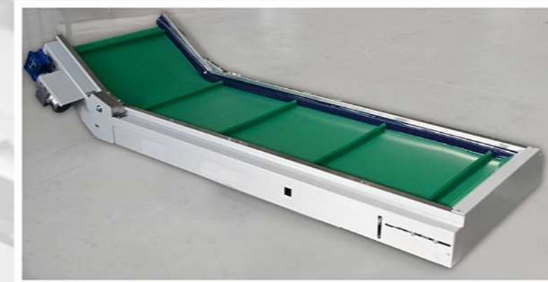
Waste conveyor belt ( option )