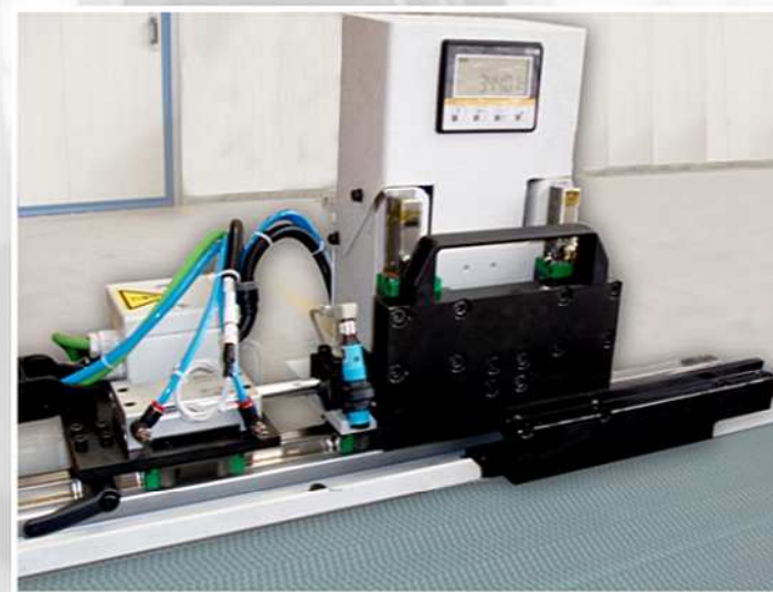
Fence for final length reference ( option )