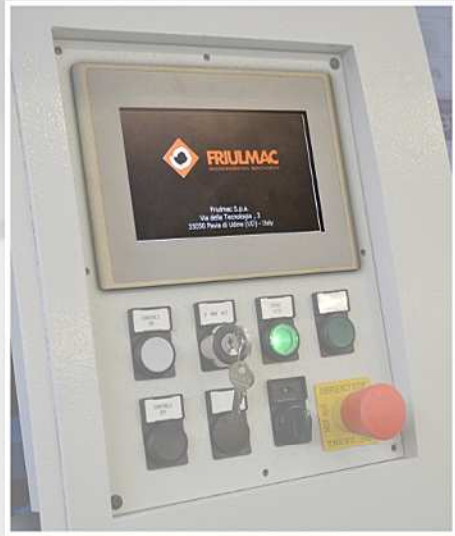
Touch-screen control panel